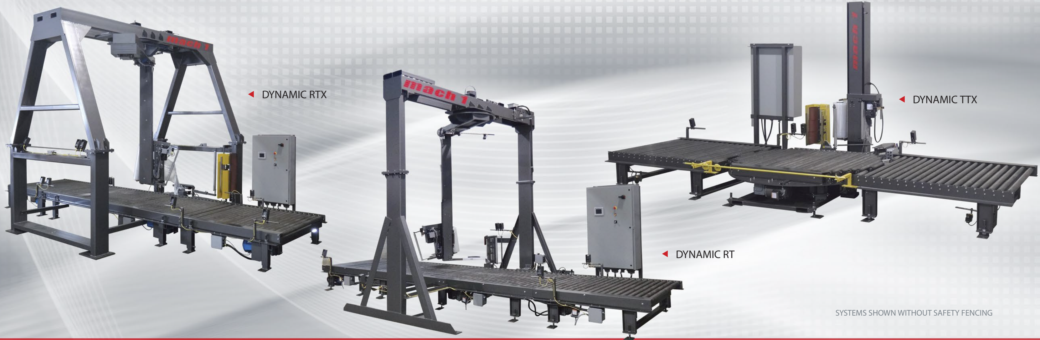
SYSTEMS SHOWN WITHOUT SAFETY FENCING